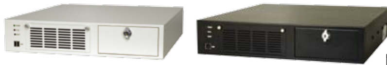
RACK-220GW / 221GW